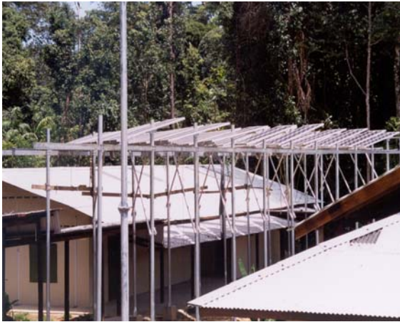
Solar installation in Malaysia